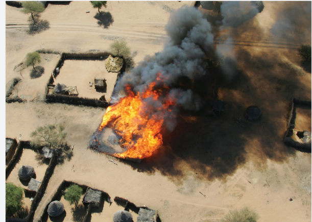
Um Ziefa burning village

The Sudanese Government has supported militia to murder, rape and displace black Africans in Darfur. They have destroyed hundreds of villages, killed tens of thousands of people, and forced millions to flee.