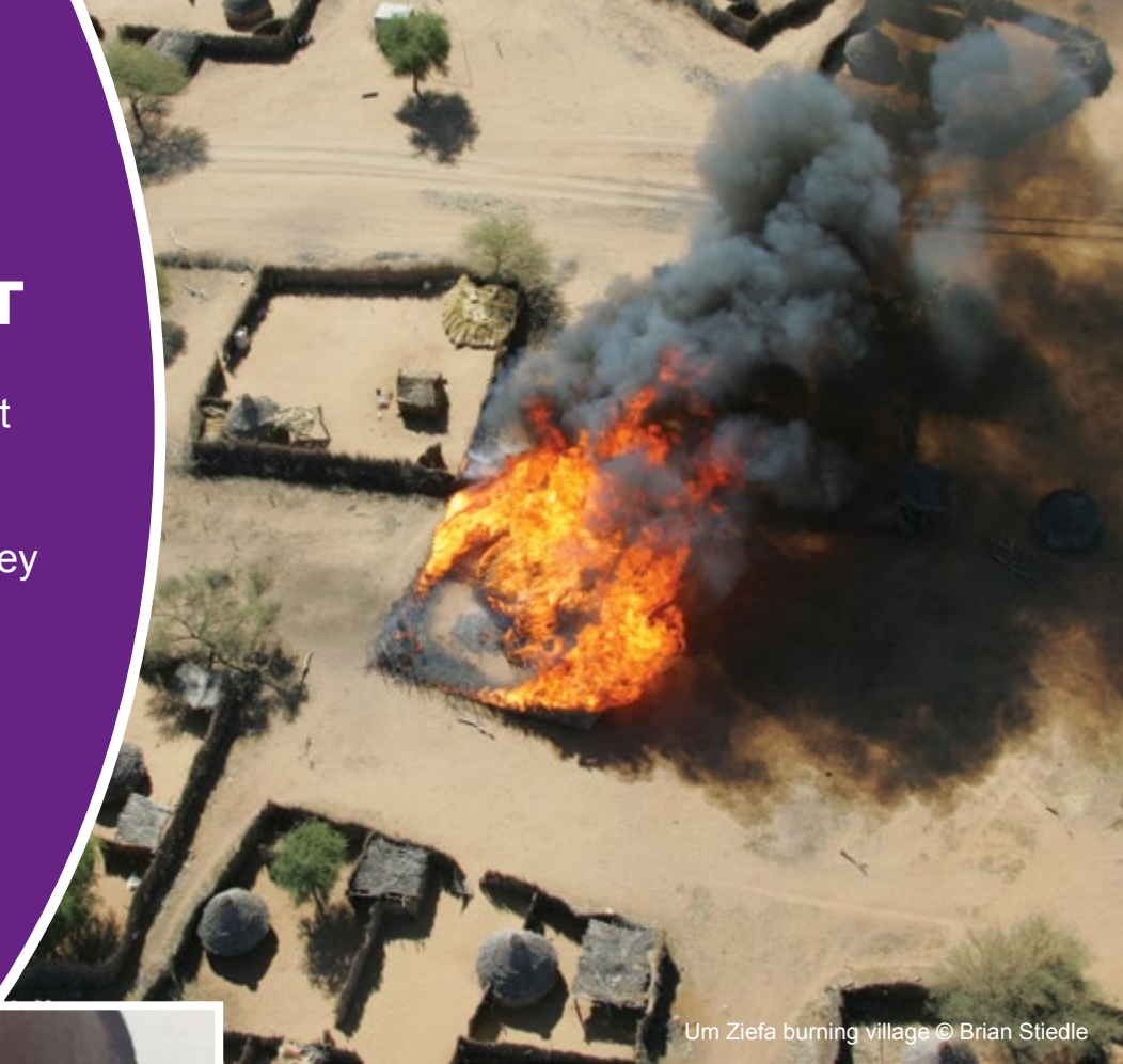
Um Ziefa burning village

The Sudanese Government has supported militia to murder, rape and displace black Africans in Darfur. They have destroyed hundreds of villages, killed hundreds of thousands of people and forced millions to flee.