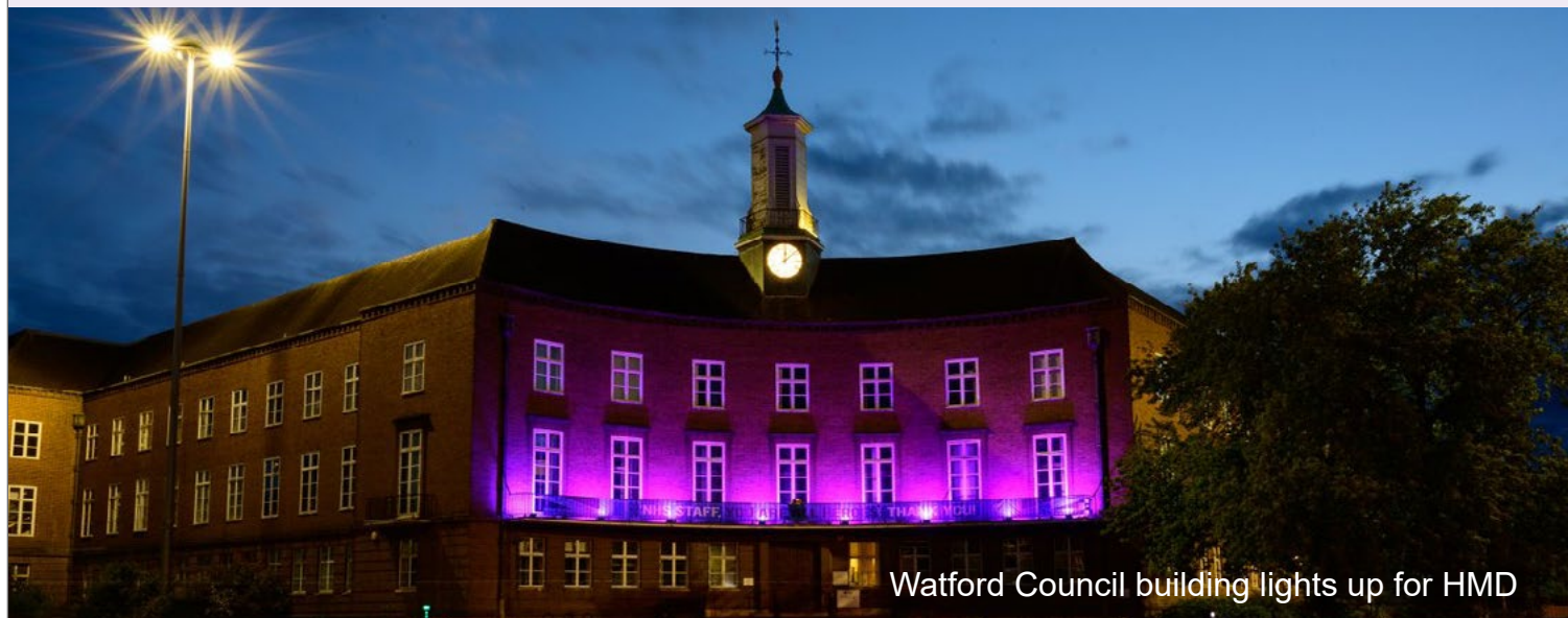
Watford Council building lights up for HMD